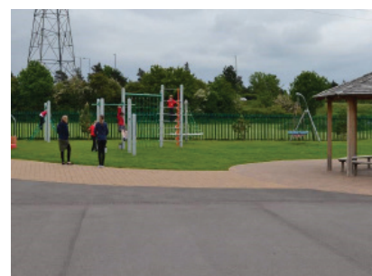
Monster Play equipment