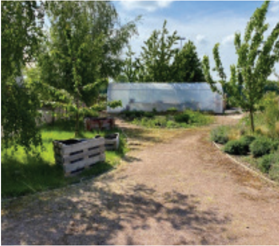
Garden & Poly-tunnel