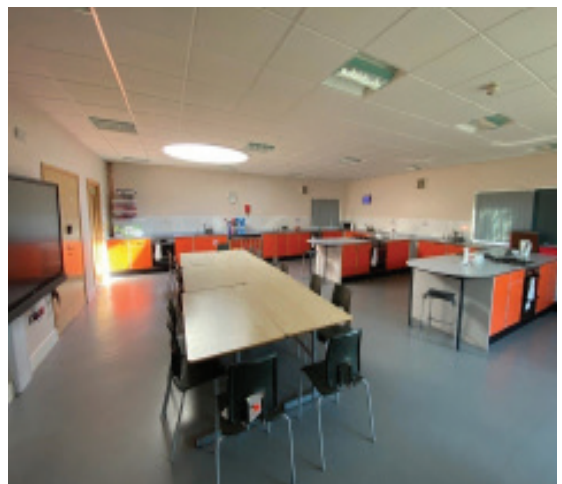
Food Technology Room 2