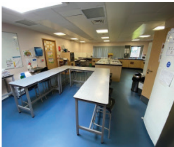
Food Technology Room 1