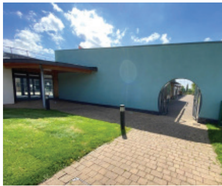
The 'mouse' hole