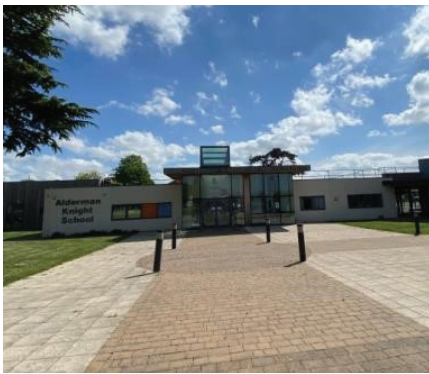
The front of school